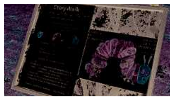
Storywalk along the Sauk River in Waterworks Park features the story "The Very Hungry Caterpillar" on 18 panels in English and Spanish.

A third winds along the railroad at Quincy Village Park.